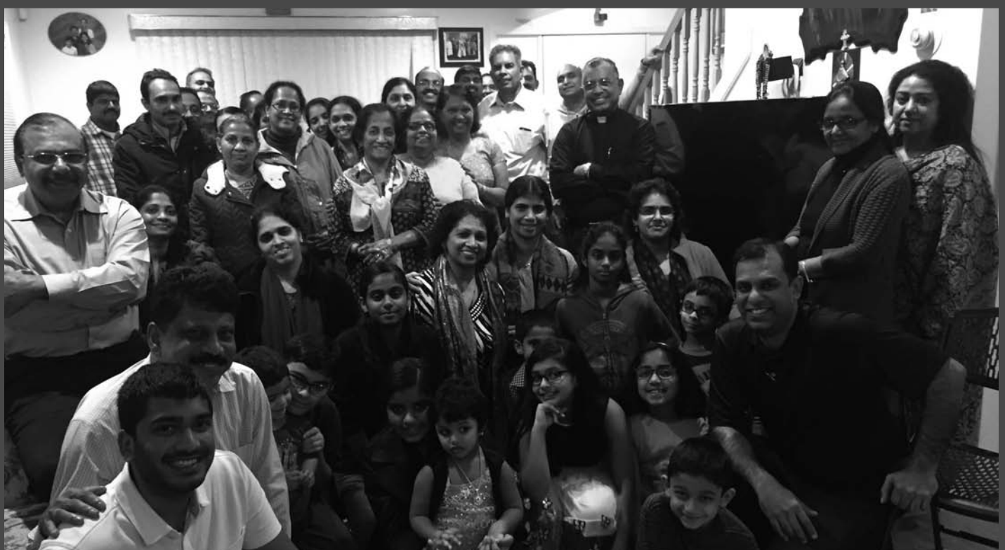
St. Joseph Ward Prayer Meeting

Sponsoring our altar flowers is a memorable way to celebrate a birthday or anniversary, remember a loved one who has passed, or to honor any other special occasion. A $100 donation compensates the cost of the flowers for a week. If you would like to sponsor the Altar Flowers, please contact trustees for more details.