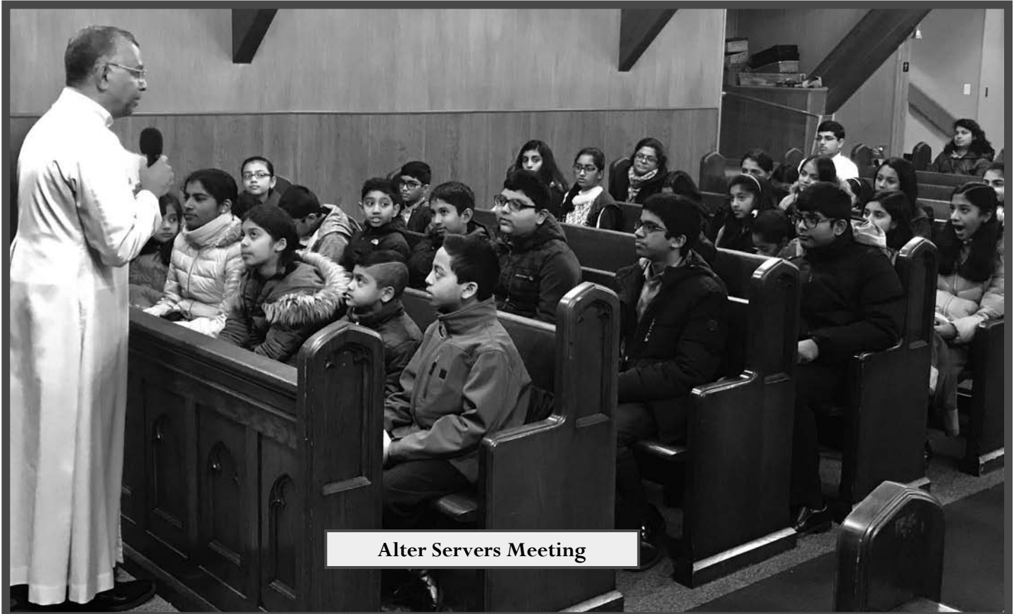
Alter Servers Meeting